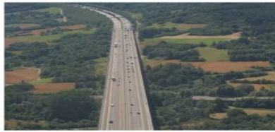
The Poinciana Parkway Expansion to 4 lanes will be done as part of CFX working to take over Poinciana Parkway from OCX

The first road built as part of the Poinciana toll road network was the Poinciana Parkway. What a tremendous success story. The road was built on time and within budget. The original traffic projection of 4,000 cars per day only allowed for initial construction of two lanes. Today's actual traffic volume on the road exceeds 10,000 cars per day. As a result, Central Florida Expressway Authority has announced that they will be refinancing the bonds and expanding the parkway to 4 lanes probably with construction being completed within 3 to 5 years.