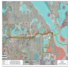
Southport Connector Turnpike Segment

CFX has now adopted an updated study for Southport Connector into their official work plan